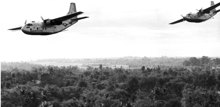
Two Ranch Hand C-123s drop to treetop level before spraying jungle foliage. Ranch Hand crews developed special tactics to avoid ground fire, a constant threat since they had to fly slowly and close to the ground for these missions.

Crews soon learned that they had to spray in the early morning, when ground temperatures did not yet exceed 85 degrees. Once the temperatures went higher, the spray would rise rather than drop to earth. Wind also could be a major problem. If its speed exceeded 10 miles per hour, herbicides would be dissipated over an overly large area and have little effect on vegetation.